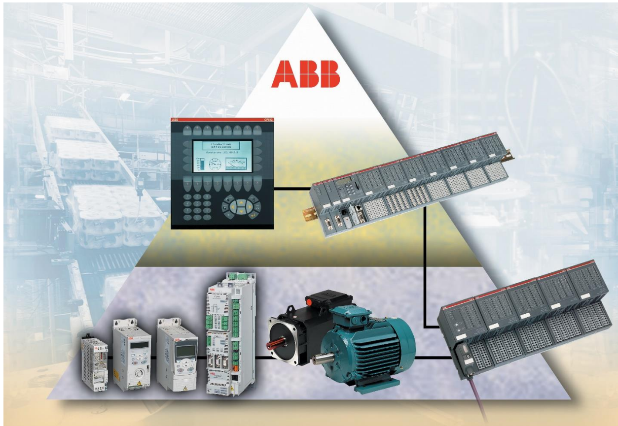
ABB (ASEA Brown Boveri) is a Swedish-Swiss multinational corporation headquartered in Zürich, Switzerland, operating mainly in robotics and the power and automation technology areas.